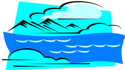
Surface Water, Ground Water (Brown, wiggly, smelly water)

LS3 = Life Saving - Life Sustaining - Life Supporting™