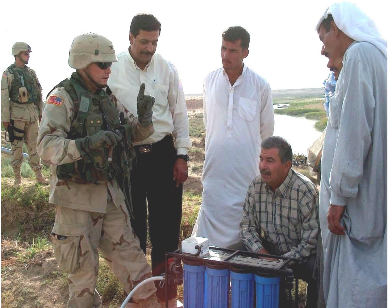
4th ID with members of Al Zowie Abu Baber Tribe Diyala Province Iraq, 2004