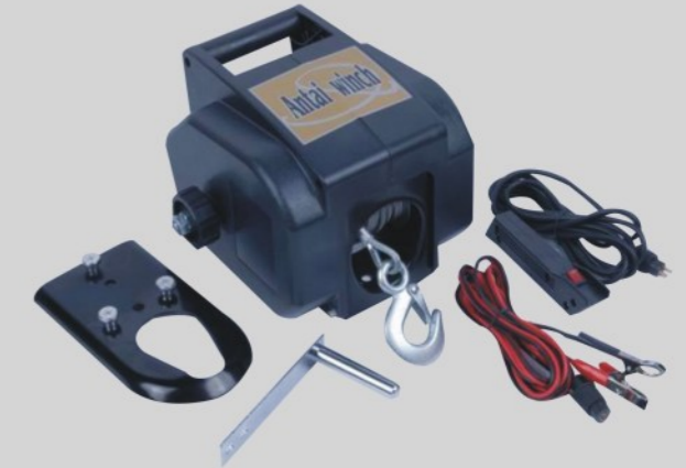
Boat winch AT2000LBS